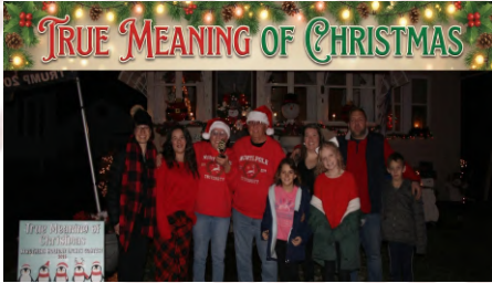
250 Elm Ct - Logan