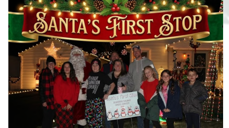
604 Maplewood - Pingley & Varga