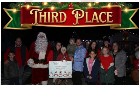
128 Hopewell - Goist