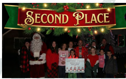
76 Overlook - Goist